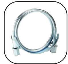
Powerlock Clamp PS (Pipe Size)

Most sizes available in lengths of 100 feet for rapid installations and lower labor costs