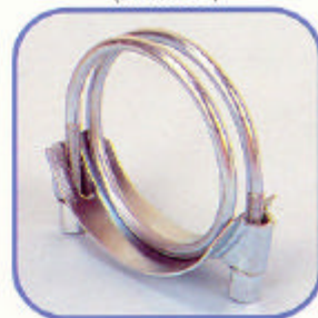
POWERLOCK CLAMP PS (PIPE SIZE)

Available in lengths of 100 ft. for rapid installation and lower labor costs.